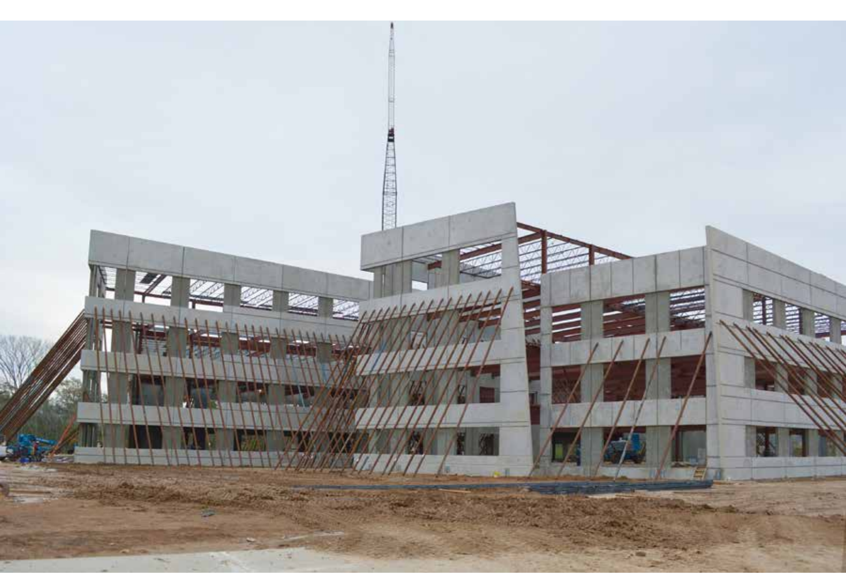
Construction photo of braced Tilt-Up panels following panel erection.