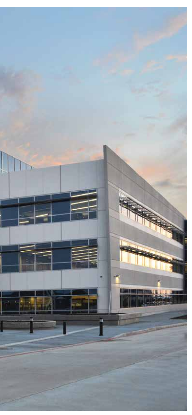
View of entrance to new Administrative building.