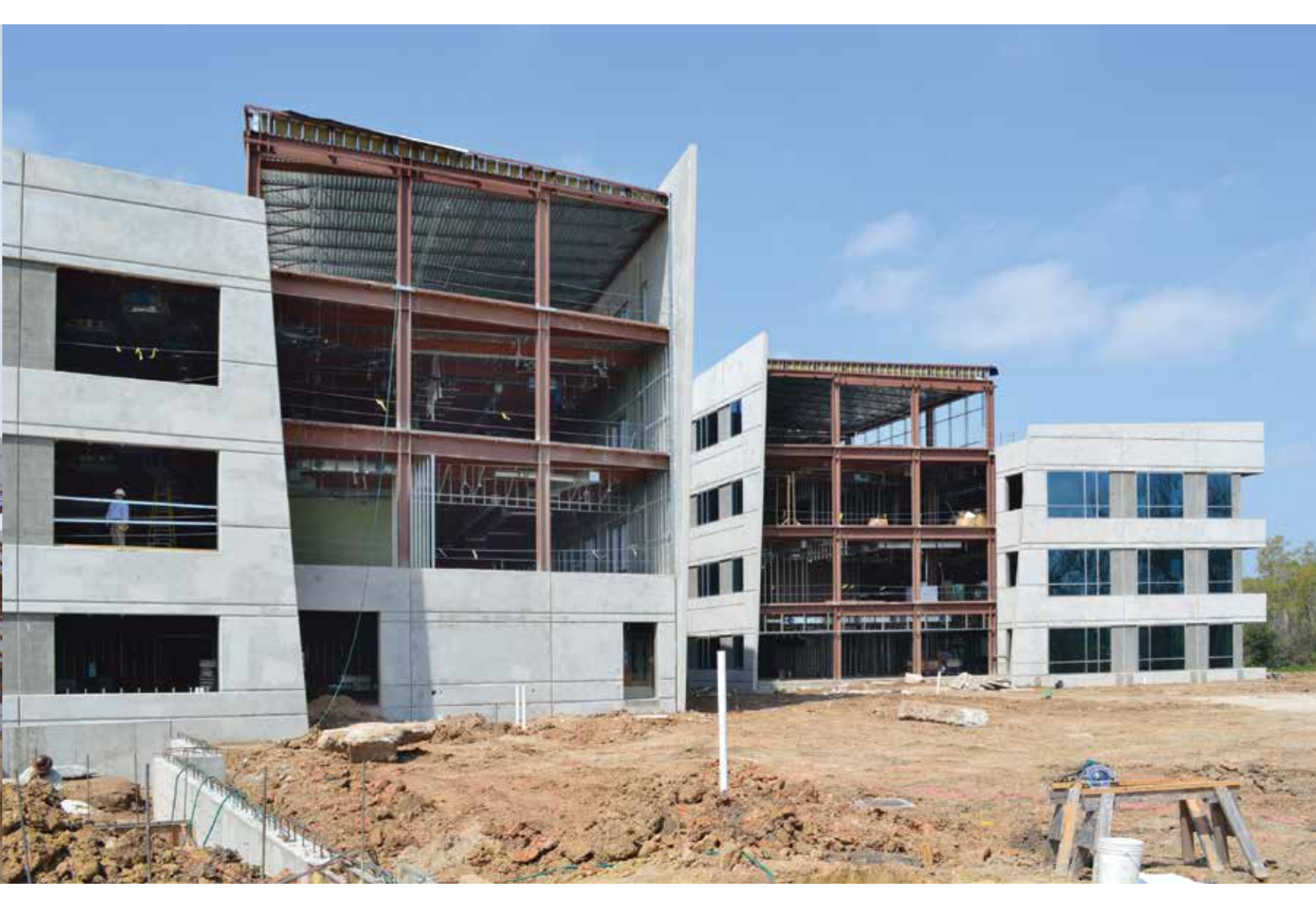
View of hybrid steel and concrete panel structure during construction.